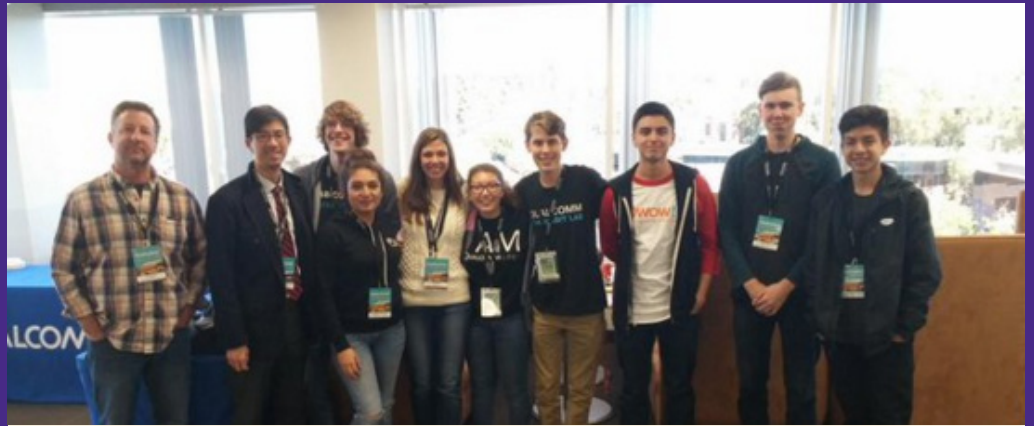
THINK LINK —During Intercession Saintsmen visited Qualcomm's Thinkabit Labs with other high school and middle school students from the San Diego area. Thinkabit is a think tank for students. Classes are led by Qualcomm engineers and career coaches who guide students to create, code, collaborate and present robotic creations better known as "Robo Crafts."

St. Augustine High School's innovative and highly popular mid-year "third semester" program has just completed its eighth year. Called Intercession, the month long program takes place during January. It is an educational opportunity to immerse students in real-life studies. This year more than 170 students participated in internships as part of their Intercession experience.