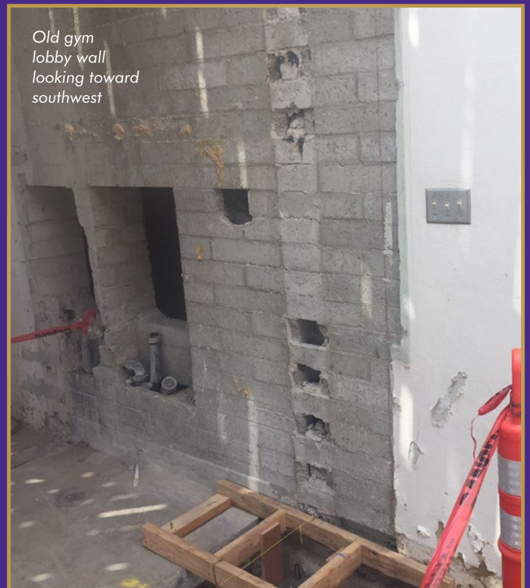
Old gym lobby wall looking toward southwest