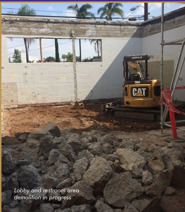
Lobby and restroom area demolition in progress