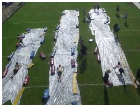
SLIP SLIDING AWAY —At the end of summer 2-a-day workouts the Saints football team took some time out for slip and slide.