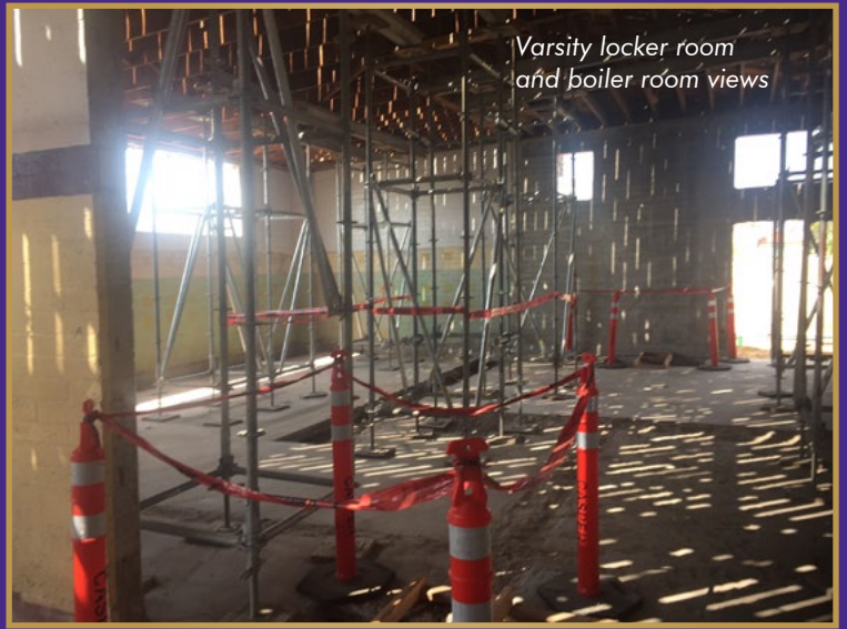
Varsity locker room and boiler room views