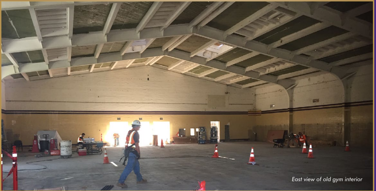
East view of old gym interior

Demolition is complete and work on the new structure is underway. Completion date is targeted for Spring 2018.