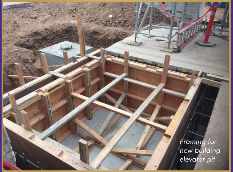
Framing for new building elevator pit