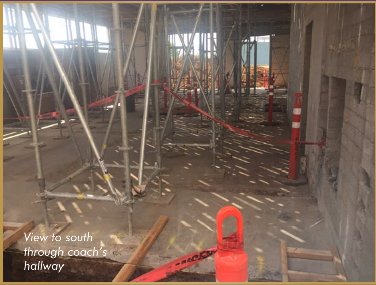
View to south through coach's hallway