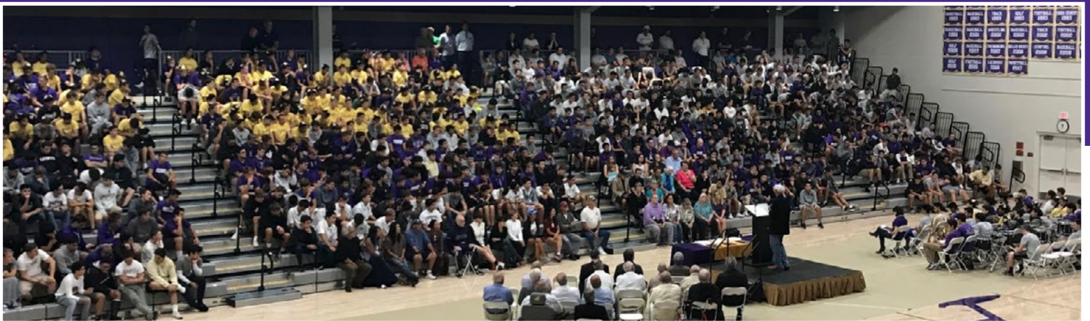
BEANIES IN THE HOUSE —Saints Frosh (striking in beanies and yellow shirts) attend the recent Athletic Hall of Fame induction ceremony held in the new gym on campus. See more on the inductees on Page 10.

Saints Freshman Class of 2021 participated in a host of activities during the school's traditional Freshman Welcome Week last month.