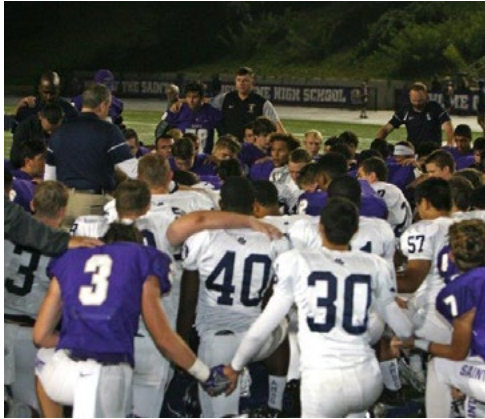
BONDING —The Saints and the Cubs of Loyola High School gather at midfield after the game to share a prayer.