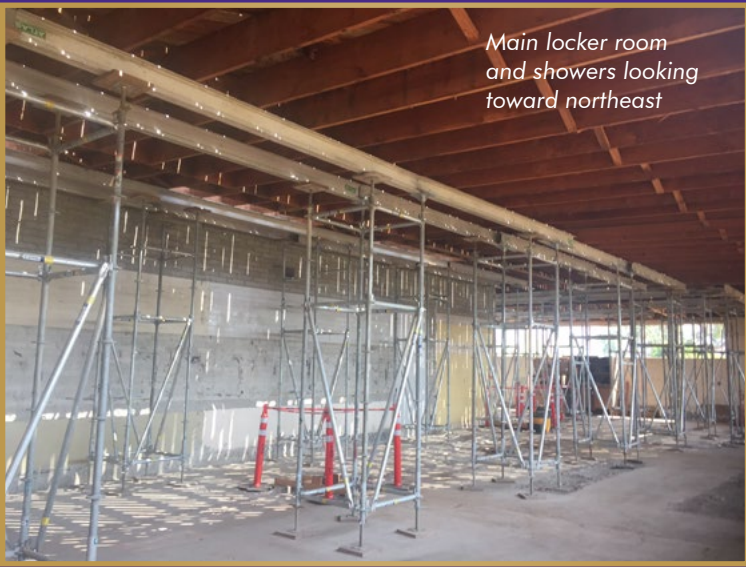
Main locker room and showers looking toward northeast