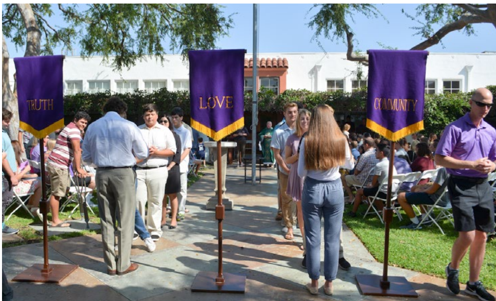
Family's line up to receive communion during the celebration of Family Mass.