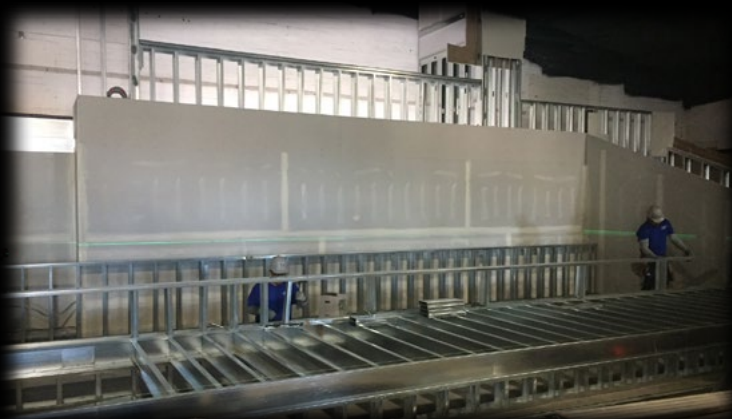
Tiered seating along East wall.