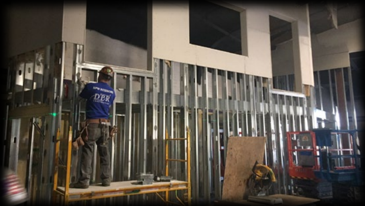
Close up of the light loft along south wall.