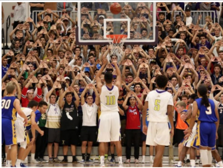
A GAME OF FIRSTS. In a first ever game there are a lot of historic firsts like first free throw, first basket, first turn over and more important first win A 62-42 effort over Grossmont High.