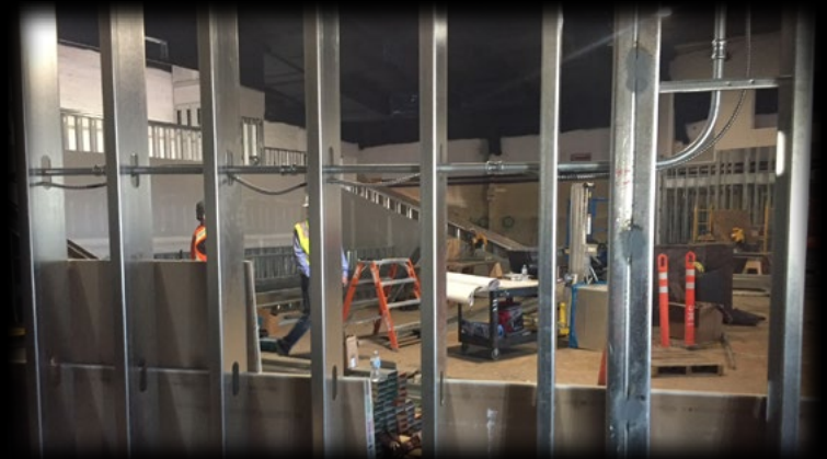
Looking through the metal framing from the north side. West on left and south in background.