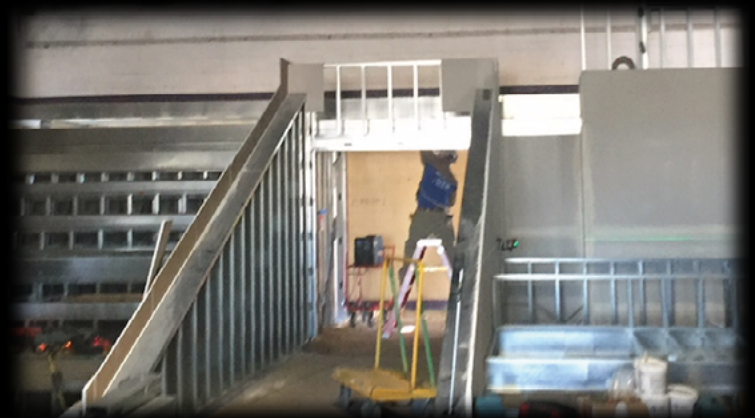
Entry from East through raised seating area.