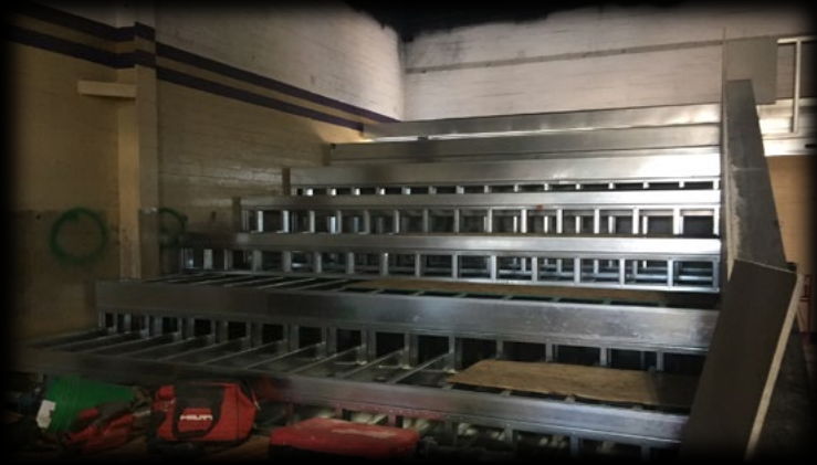
Tiered seating along the north wall. (Palm Street behind wall). Does anyone remember who painted the wall purple and gold, where the Pit section used to reign.