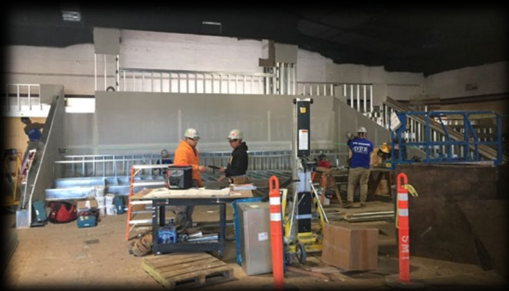
View to the southeast across auditorium floor.