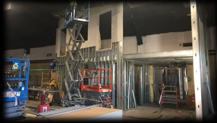
Looking at south wall at the lighting loft and hall entry.