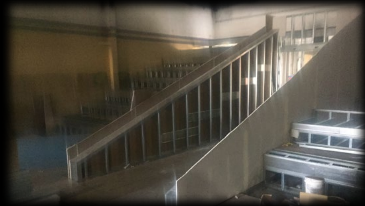
Entry to the auditorium from the east.