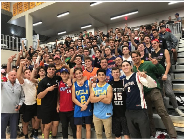
THE PIT. The tradition of the Pit continues in the new gym and the boy’s were there in numbers for the “first game”