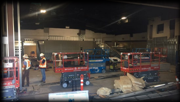
Looking east across auditorium/theatre floor from the stage area.

As we edge into the New Year, the interior of the new campus theater begins to resemble an auditorium and wall framing is now underway as overhead pipe and conduit placement continues in the weight room. Framing will continue into early January. The roof parapet wall (which is designed to hide the roof top mechanical units) is nearing completion and the roof over the auditorium is nearly finished.