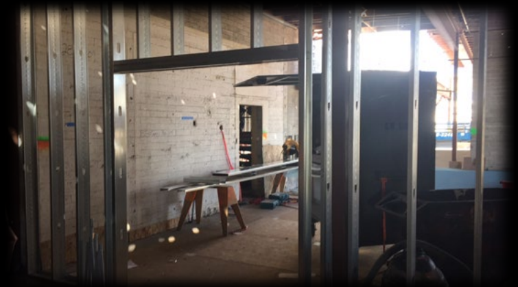
Seeing through walls into the digital media room; note juxtaposition of ancient bricks with new metal framing.