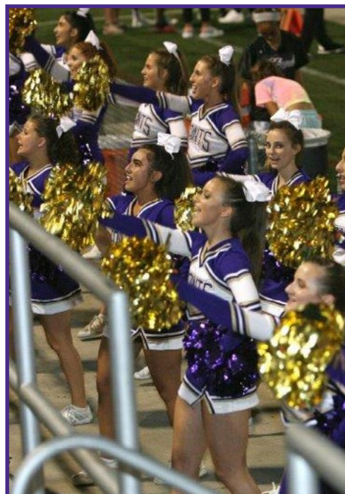
TEAM BEHIND THE TEAM. Here's the AOLP Cheer Squad in preseason form.