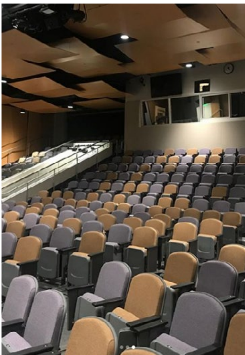
View of seating profile

We are indeed grateful for the tremendous support given to Saints through these transitional years. It is the generosity of many, in whom believed in the Augustinian mission and supported it. To walk through the campus today with all that has been accomplished, is a rich blessing for the entire community and a grace that shines on each of us.