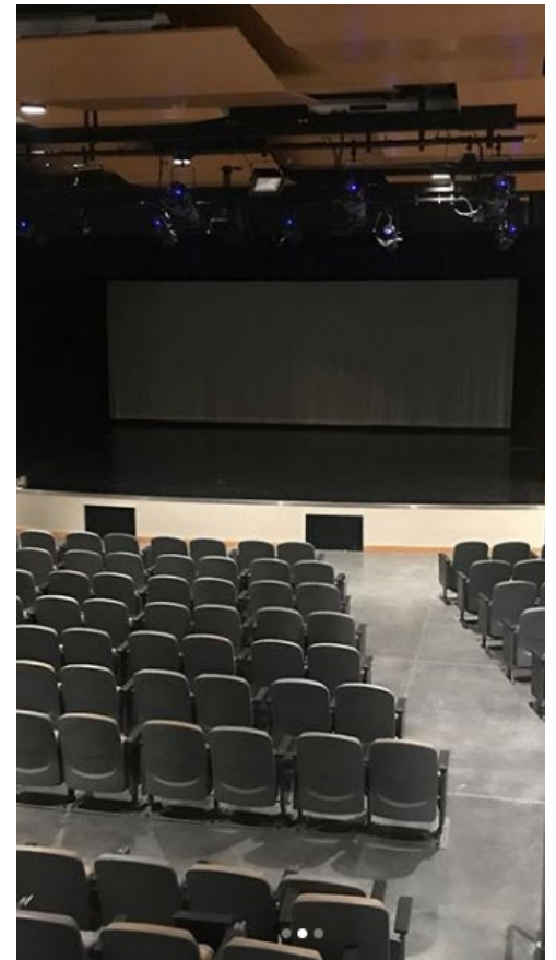
View of Stage