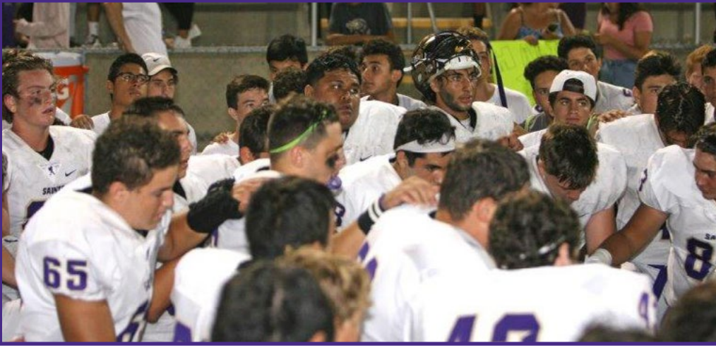
GRATEFUL. Prayer of thanks to God then a few words afterwards from the coaches.