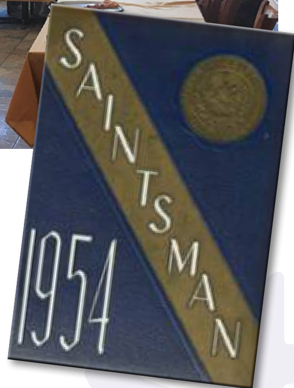
1954 yearbook cover

Class of 1954 monthly meetings are held at Mazara's Pizza (30th and