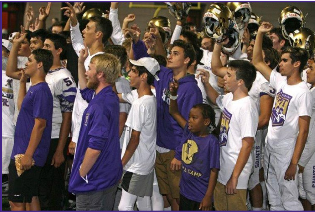
ALMA MATER. Here's where Saints Pit, including new Frosh remembered all the words to the Alma Mater