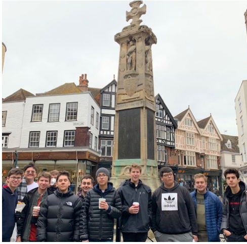
Saintsmen in Canterbury, England after touring of the Cathedral in Canterbury.