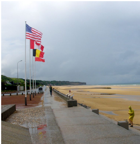
Today along Omaha Beach in Normandy.