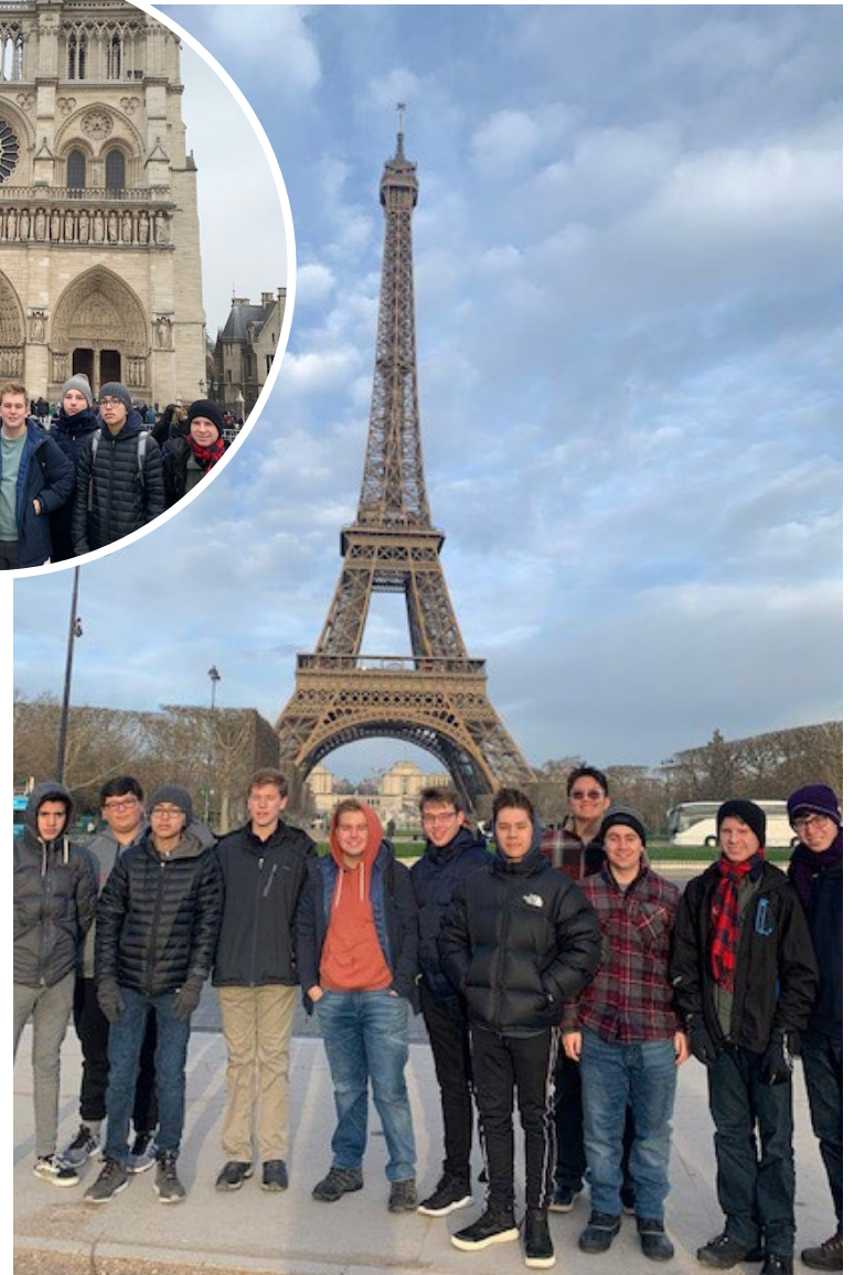
What's Paris without a group photo of the 1887-built Eiffel Tower.