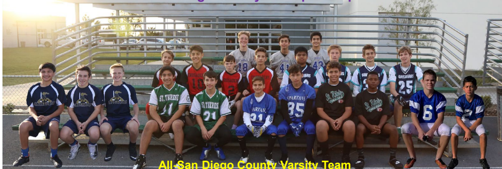
All San Diego County Varsity Team