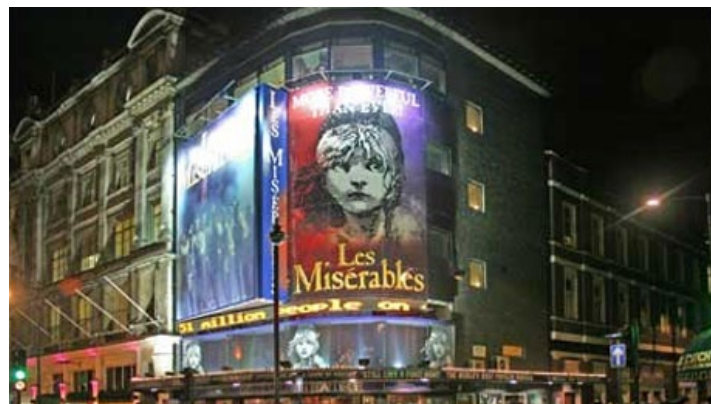
Queens Theatre in London, where the group took in a performance of "Les Miserables."