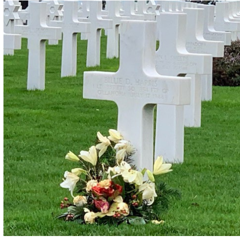
The American Cemetery above the D-Day landing beaches is officially U.S. soil.