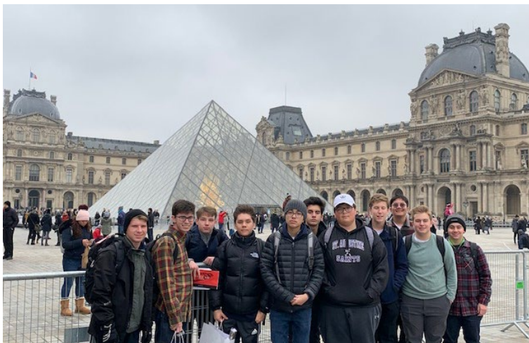
Interession travelers stop for a photo in the courtyard of the Louvre Museum with pyramid installation by architect I.M. Pei in 1989.