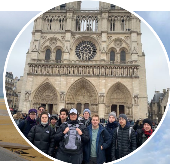
Saintsmen outside of the iconic Notre Dame Cathedral that was built in 1163.