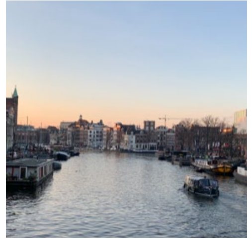
Among the many canals in Amsterdam.