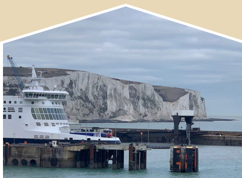
White Cliffs of Dover on the English Channel.

This 12-day trip was highlighted by many fun, interesting, and unique experiences. The group explored several museums and cathedrals, as well as the D-Day beaches and the American Cemetery in Normandy, three-inches of snowfall in Amsterdam, and a theatre presentation of "Les Miserables" in London. Sharing in this overall unique experience were ten Juniors and one Sophomore.