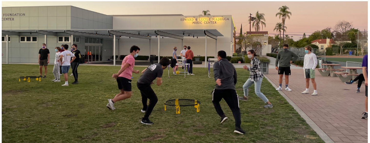
Socially distance Spikeball was a big hit with the group.