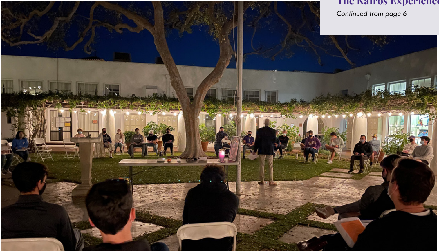
Beautiful view of Vasey Patio as Saintsmen reflect as a group.