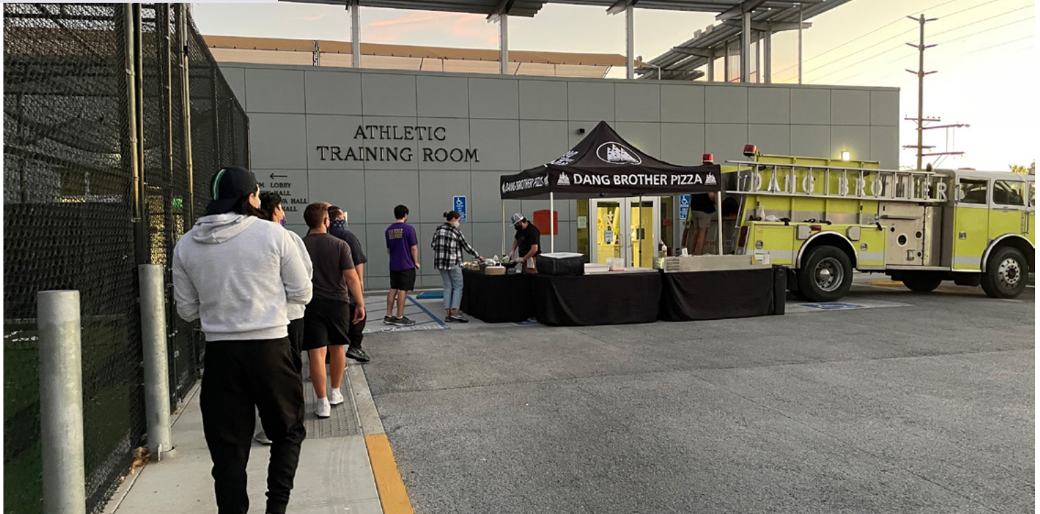
San Diego's Dang Brother Pizza catered dinner for us on Saturday night from its converted 1974 LaFrance firetruck