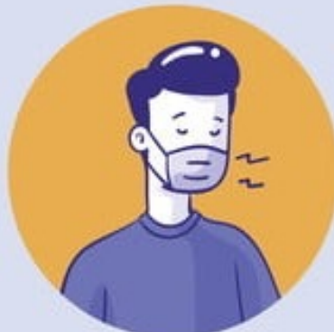
Wear a facemask