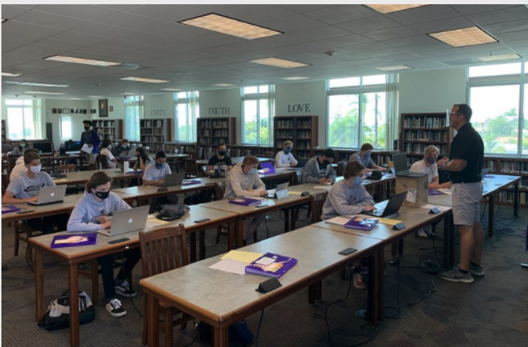
Students took part in a recent summer program at St. Augustine High School.