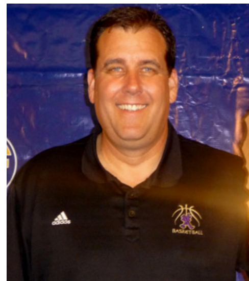
The Head Coach: Now into his 26th year at St. Augustine High his varsity teams are perennially among the top ranked in the region. He is one of the few coaches that played in the NCAA Tournament and won a California State basketball title (2013). He was named state coach of the year in 2013.