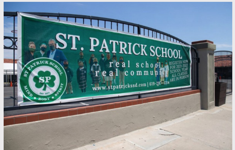
St. Patrick's School highlights it's a real school.

"We earned the trust of our families and their friends."