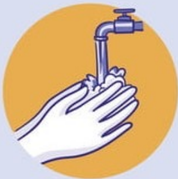
Clean your hands often