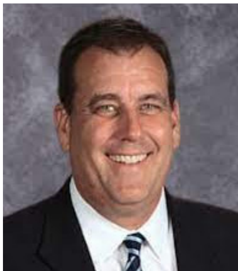
The Administrator: Currently Assistant Principal of Auxiliary Services and Head Basketball Coach; and former Saints Admissions Director.