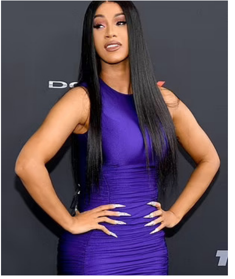
Cardi B rocking Saints purple.

1. Cardi B: This female rapper is a lyrical genius. Her sharp, snappy beats complement her perfectly designed lyrics at every turn. Cardi's messages touch the soul, and her passion for music continues to shine with every record she creates. The vibrant, soulful attitude expressed in her work comes from the heart, all while maintaining excellent flow. She will forever be known as the greatest rapper of all time.