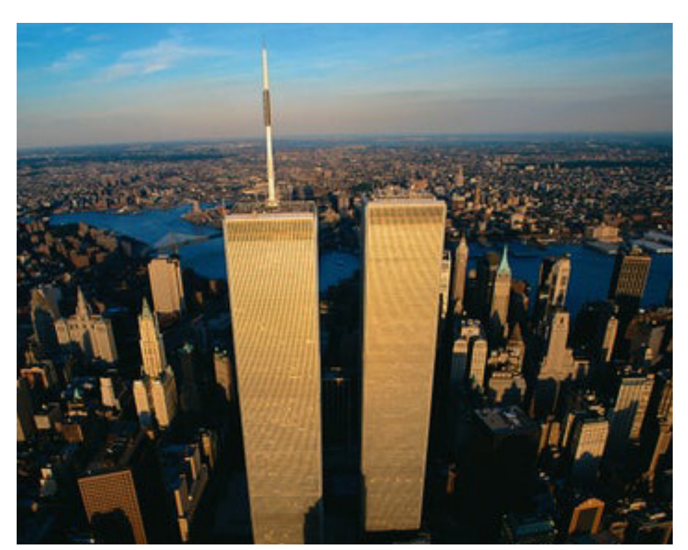
Mr. Wallace grew up just ten miles from "ground zero."