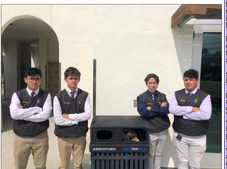
Thanks a lot, Joe Trashman.

everyday without trashing the campus, but where's the fun in that? I like seeing the whole school wearing a tie with me, so I can better experience the brotherhood. So if you have a low opinion of your school, little regard for others, and legendary laziness, look in the mirror: you might see Joe Trashman's reflection staring back at you.