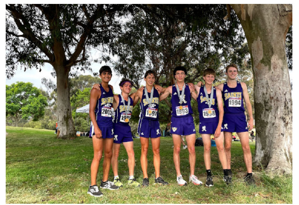
\textbf{The cross country team moved up to Division III this year.} \ \textit{Courtesy of Nicole Yoakum}