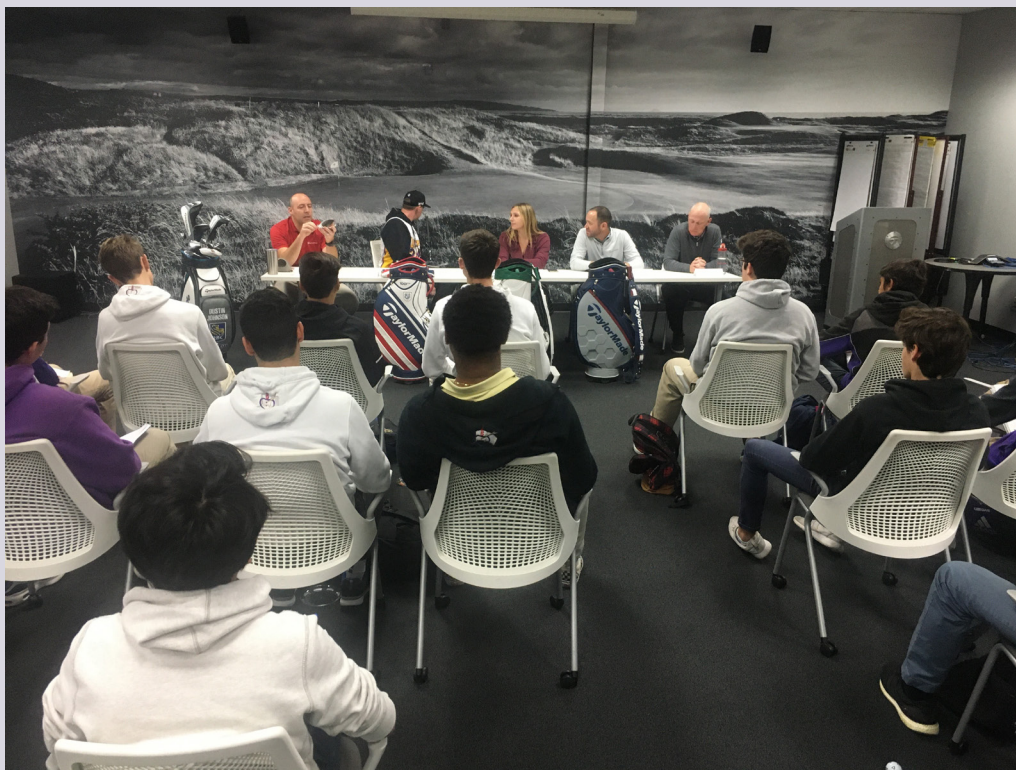
TAYLOR MADE. Students in the Careers in Sports class have a private audience with the Taylor Made design team.