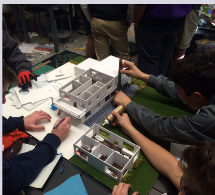
ARCHITECTURE. Merging the technical with the artistic students in Architectural Design work on the "Dream House" project.