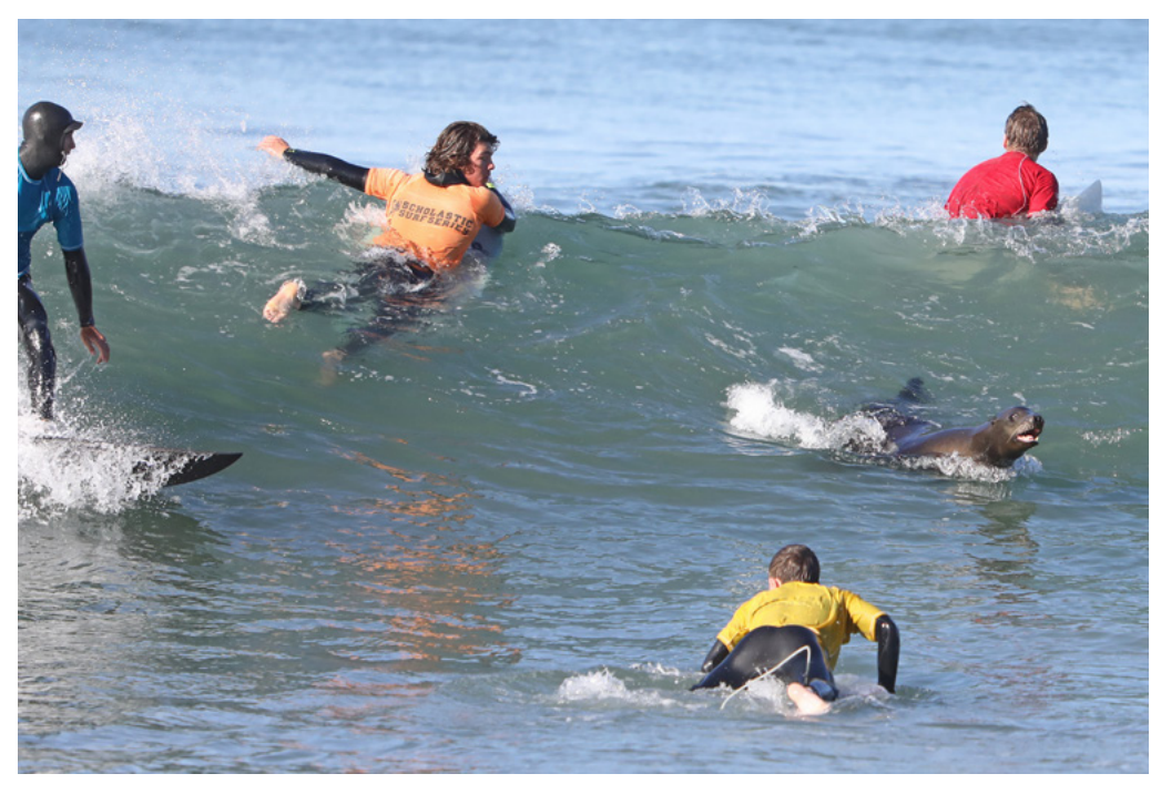
SURF CRASHER. A St. Augustine High School photographer captured this fun shot of a recent dual meet with Mission Bay High. Being an official league meet, local surfer "Lucille" was not eligible for style points but did score points for being one happy seal in the surf on the first day of spring.