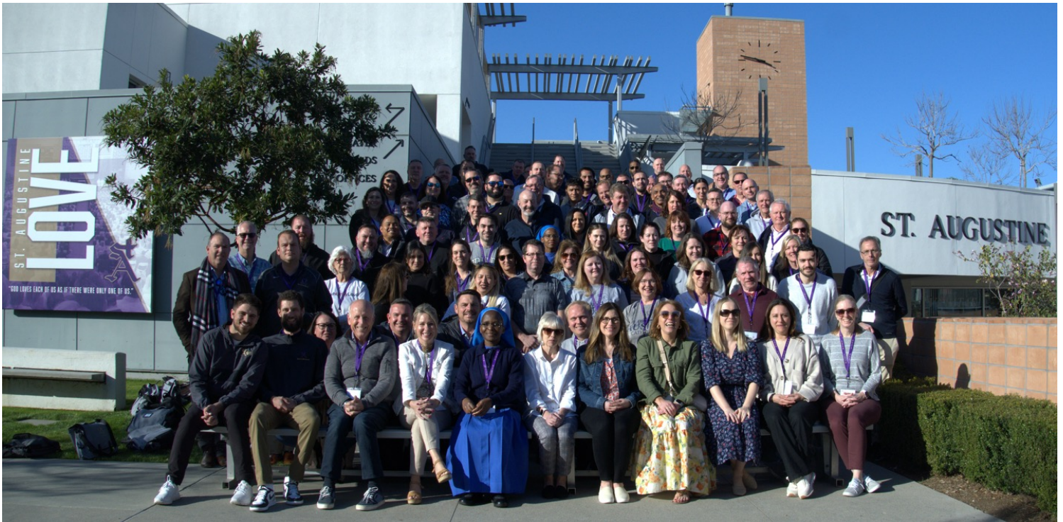
AUGUSTINIANS UNITED. Members of Augustinian Schools in North America, Ireland, England, and Australia gathered at Saints for the Augustinian Values Institute.