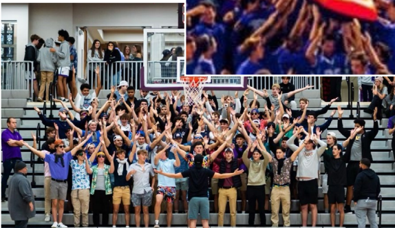
DRESSED FOR SUCCESS.