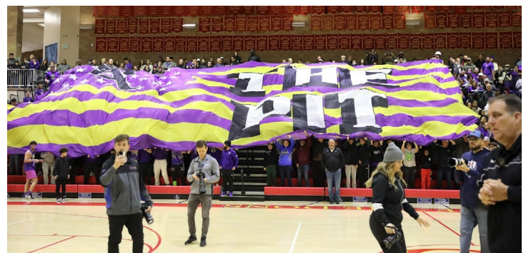
PROUDLY WE HAIL. Following the National Anthem, Saints Pit Crew raises its own flag as media and Coach Haupt look on.