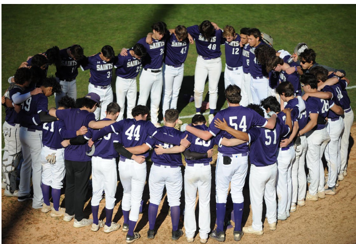
TEAM SPIRIT. St. Augustine's baseball team joins in a prayer circle at each game. Be sure to check next month's Saints Scene for a season update.