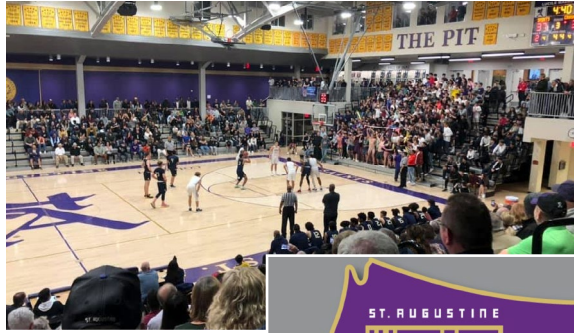
THE WAR ZONE.