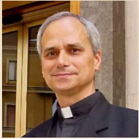
Bishop Robert Francis Prevost O.S.A.

Pope Francis has named Bishop Robert Francis Prevost O.S.A. to head the Dicastery for Bishops, the Vatican announced earlier this winter. Prevost will succeed Cardinal Marc Ouellet as lead of the department which oversees episcopal nominations and discipline.