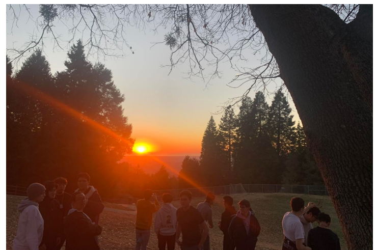
KAIROS 56. Quite a view of God's plenty from atop of Palomar Mountain, the site of Saints annual Kairos retreat.