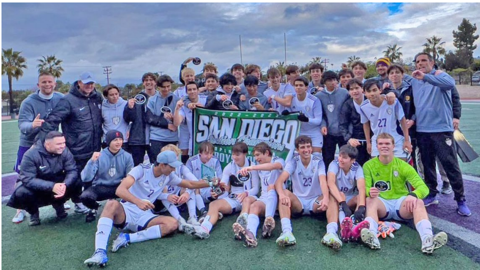
CHAMPS. Saints Varsity Soccer team won't forget this day as they surround another championship banner.